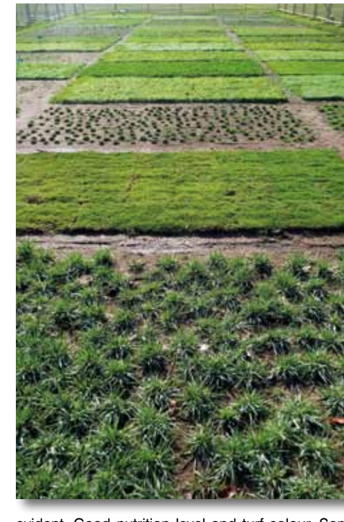
evident. Good nutrition level and turf colour. Some encroaching contamination from surrounding plots Moderate thatch.

D: Established by sod. Possible mite damage is